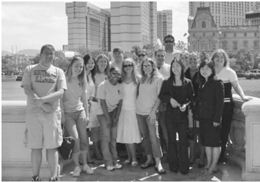
Hospitality and Tourism students attend the Las Vegas International Hotel and Restaurant Show