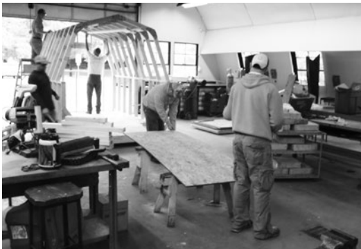
Students in the Agriculture Systems major construct a shed